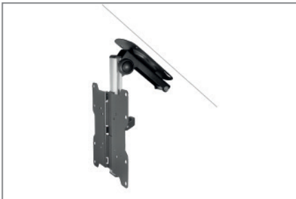
also suitable for sloping ceilings