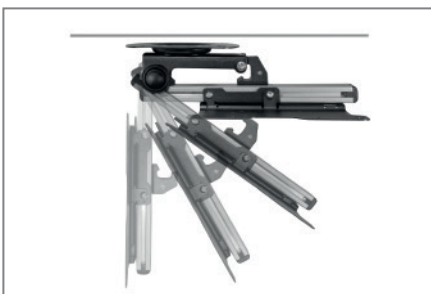
space-saving folding of the mount